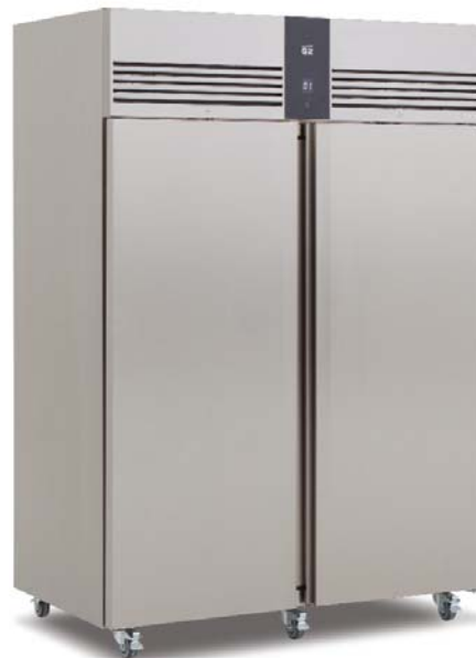
EP 1440H Refrigerated Cabinet