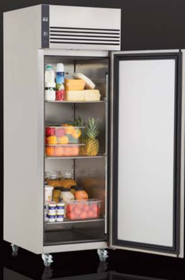
EP700H Refrigerated Cabinet