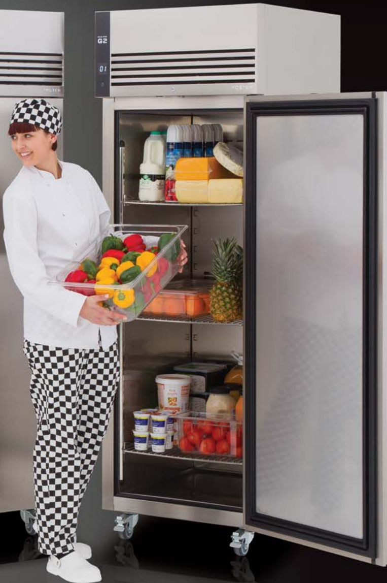
EP 700H Refrigerated Cabinet