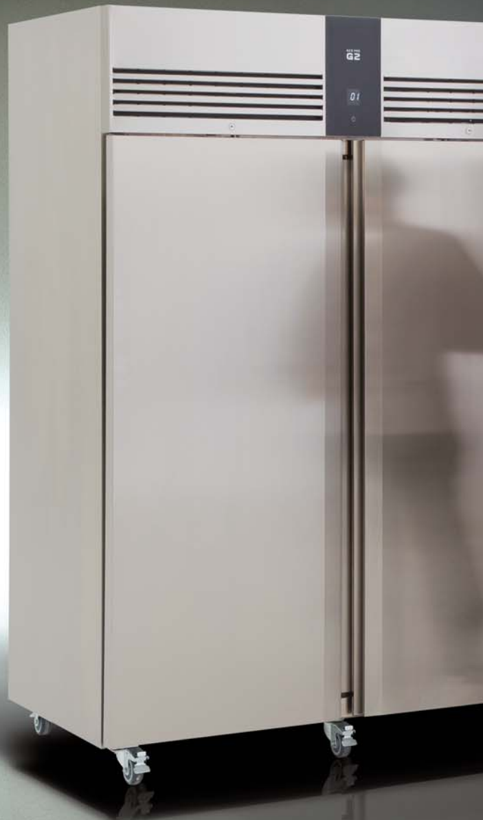
EP 1440H Refrigerated Cabinet