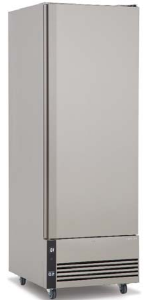
EP700U Undermount Refrigerated Cabinet