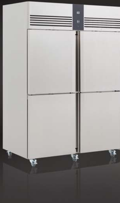
EP1440H4 Half Door Refrigerated Cabinet