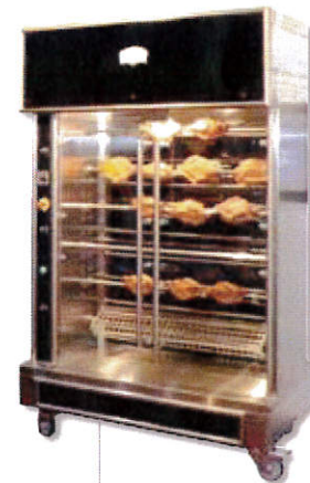
■ ITESB6 + ITAHESN

Drip grease tray on runners for an easy remove and easy cleaning