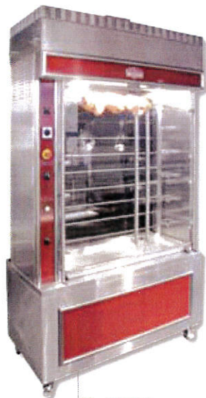
■ ITESB6 + ITPEB272 + ITAHES

This hood does not need a chimney to evacuate the smoke, you have the possibility to install your rotisserie inside your shop.